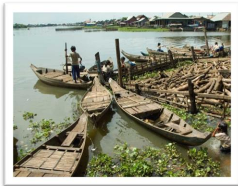
Canoes by pagoda at high water

The combination of Beng Mealea and Kompong Khleang is one of our most popular tours. If you only have time for one of our tours; take this one: It's a fantastic day!