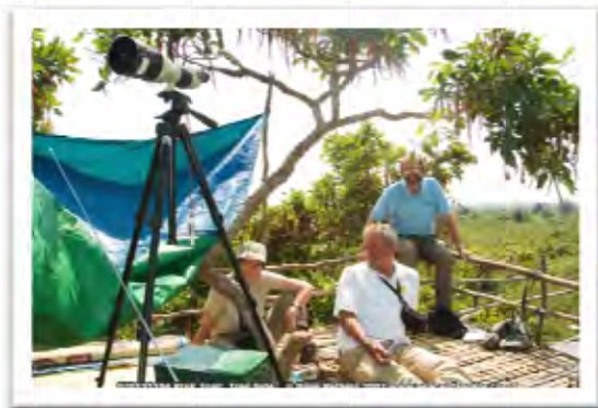
<- group at hide

Early start for the drive to Chong Khneas floating village; where we board a boat to take us across the great Tonle Sap Lake to Prek Toal village. Early in the season we can take a boat right into the heart of the mangroves to a tree top hide. We can see the thousands of storks and other birds nesting in the trees. As the water levels drop during the season; we see the birds fishing on the lake in vast numbers. It is one of the wonders of South East Asia.