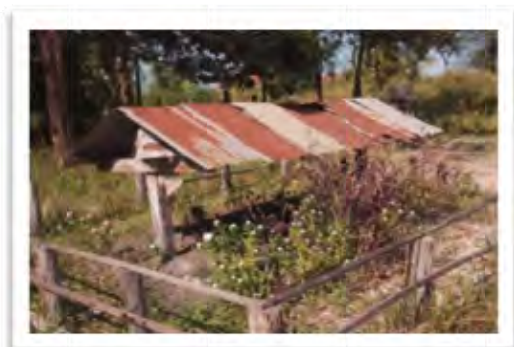
Pol Pots Grave

Accommodation will be in the village as the hill village where guest housed were destroyed early in 2009; The village is being reconstructed in December 2009 so it's unlikely there will be accommodation on the mountain at present