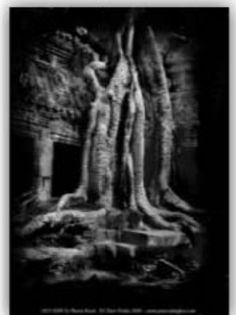
Ta Prohm Roots 2002