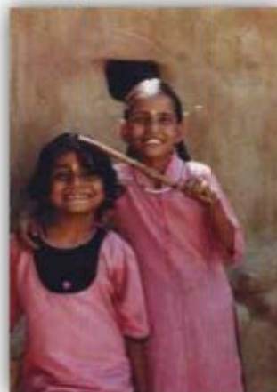
Jaisalmer Girls; India 1993