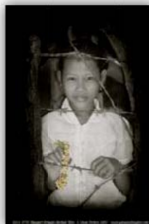
Bouquet Through Barbed Wire; Kiling Fields 2002 ->