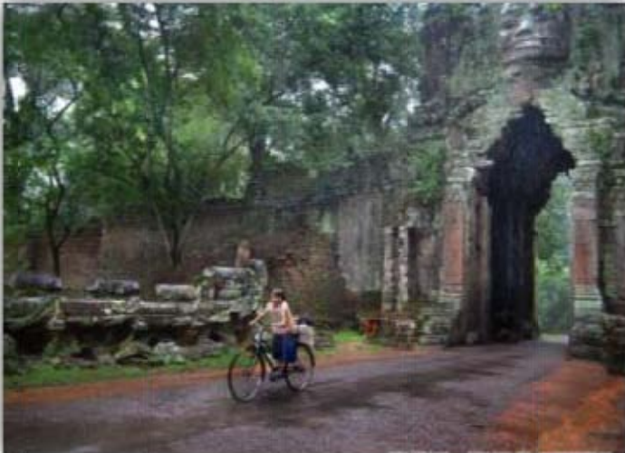
Angkor Thom Cyclist 2003