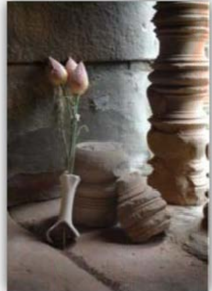
Lotus Still Life; Banteay Samre 2003 ->