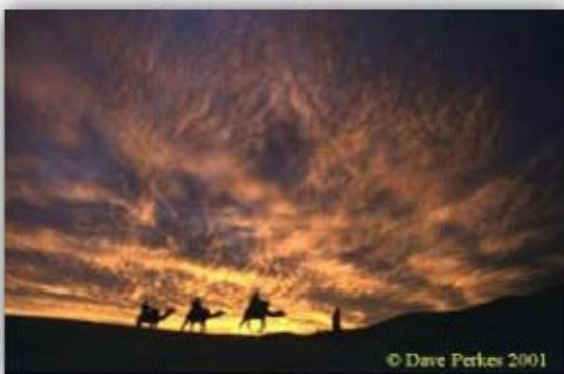
Sunset with Camels Xmas day Morocco 2000