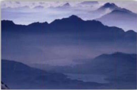
Blue Mountains Switzerland 1979