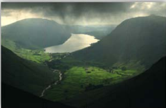
Wastwater English Lake District 1990