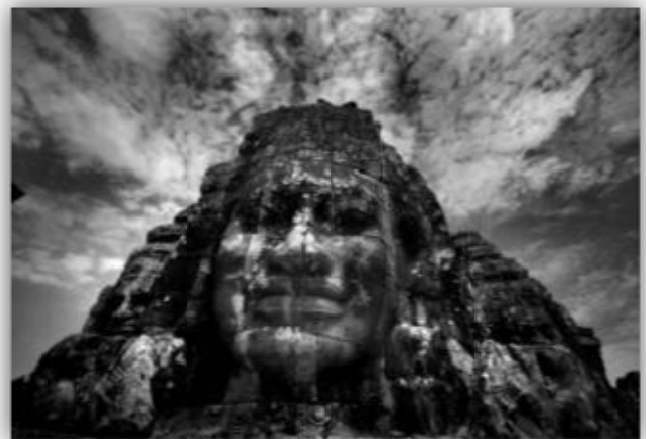
Bayon: July 2008 ->

I do hope these images will be an inspiration to you. Have fun and enjoy Angkor!