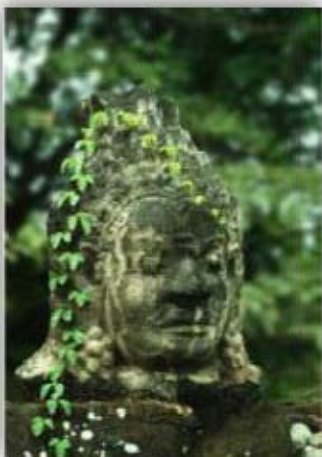
Green Head: Cover image for the Siem Reap Angkor Guide November 2008