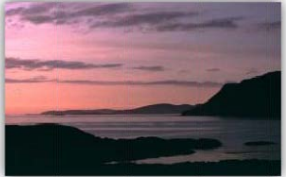
Ardmenach Isle of Mull 1988